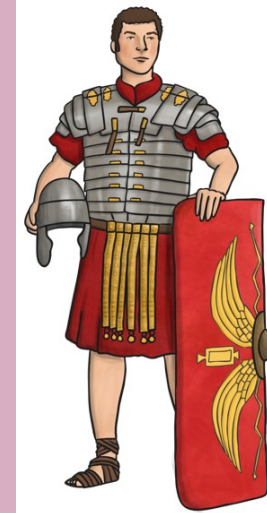
A Roman soldier

I will use different sources to find out about the past, including written accounts, pictures, historical fiction, artefacts from a museum and the remains of Roman buildings from a visit to Caerleon.